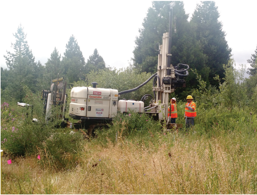
Soil extraction for testing of the Roseburg property in Mount Shasta, California. The testing is part of an Environmental Protection Agency Brownfields Grant.

Therefore, in nearly every case that an EIA is conducted, planners have an opportunity to enhance how health is examined—including the factors considered and why they are important, how they are measured, and the extent to which different populations are affected. Such an approach leverages existing resources, parallels community engagement steps, and can help build relationships across disciplines through the process of sharing and assessing information and developing recommendations to address negative impacts, or enhance positive ones.